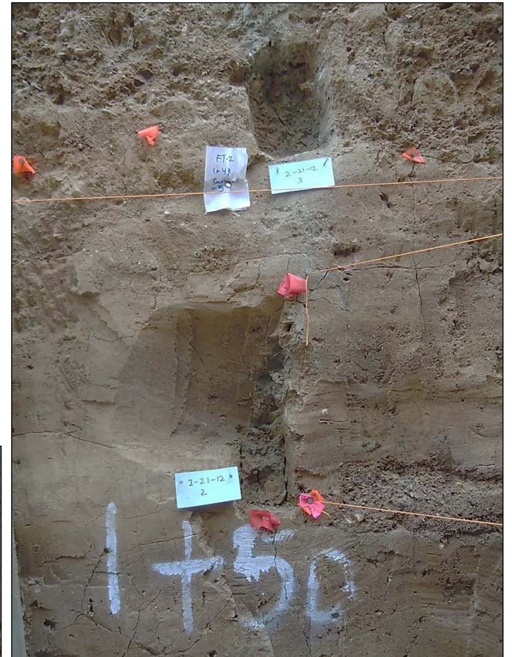
Station 1+50 South Wall Offset gravel