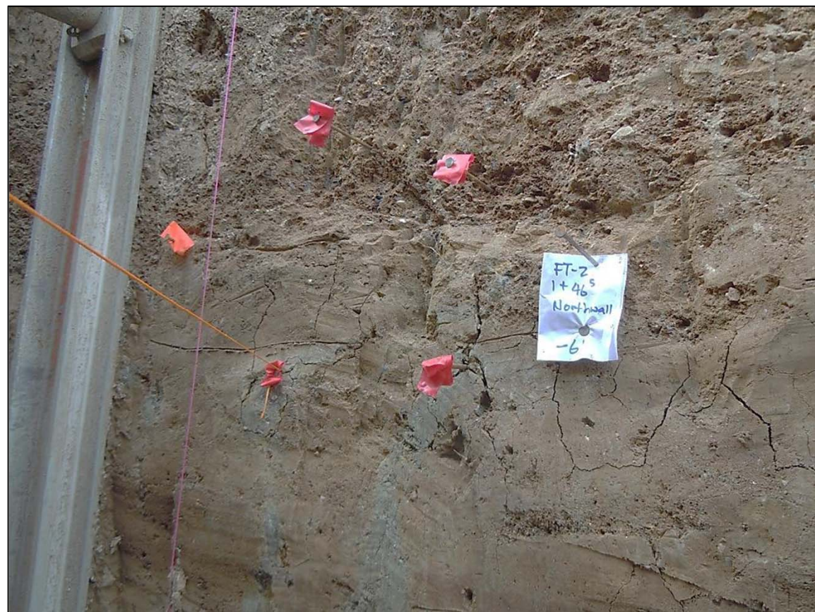
Station 1+46.5 North Wall before sample collection