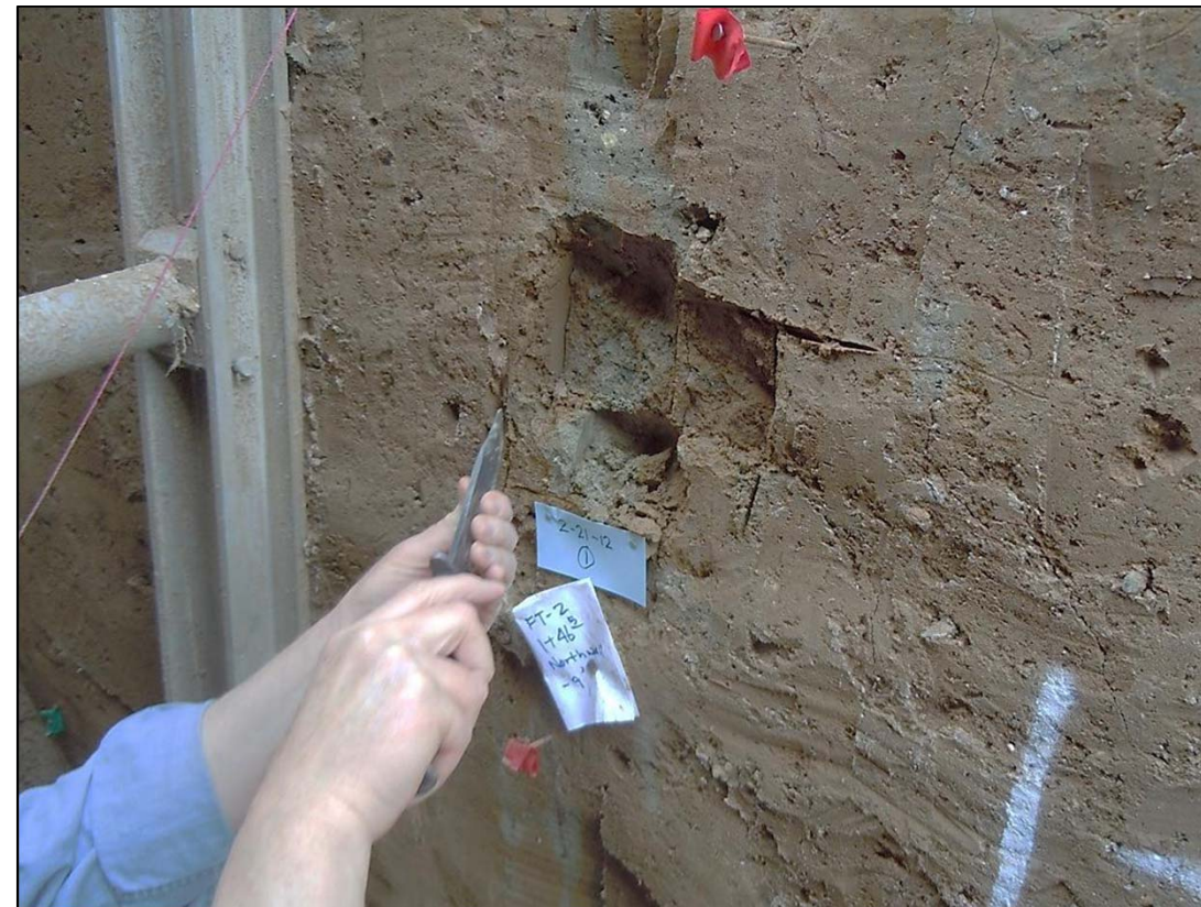
Photographs during Soil Microfabric Sample Collection Beverly Hills High School, Beverly Hills, California